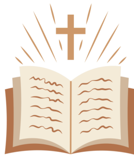
USCCB Sunday Readings: