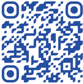
Bishop Simon Peter's Letter: